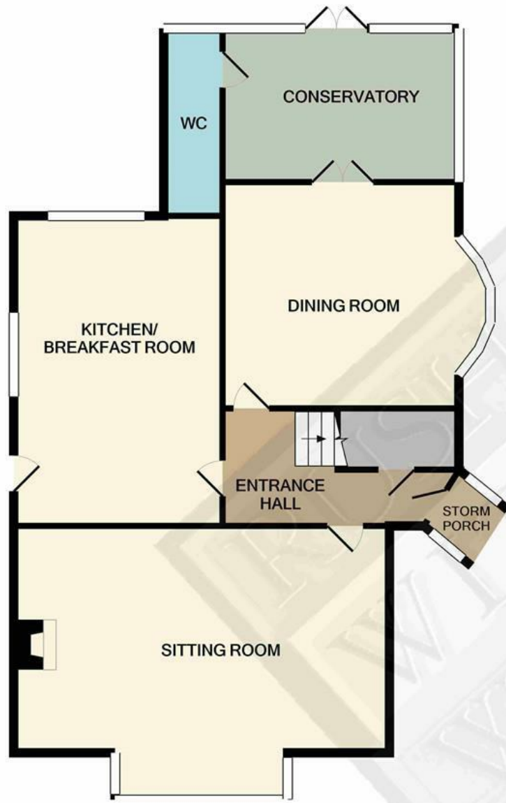
GROUND FLOOR APPROX. FLOOR AREA 806 SQ.FT. (74.9 SQ.M.)